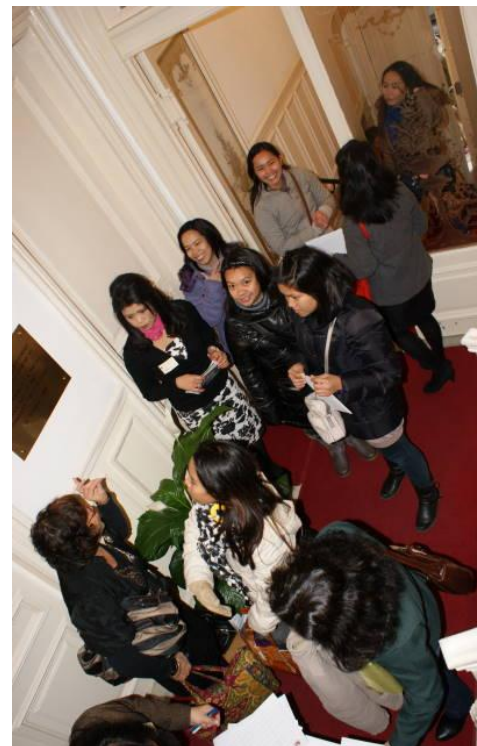
Au pairs arriving at the embassy are invited to register first.

Each of the attending au pairs was given an information packet. After the pre-session registration and greetings, the participants were invited to turn their attention to the programme itself.