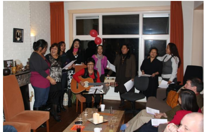
Bayanihan Ladies in Action