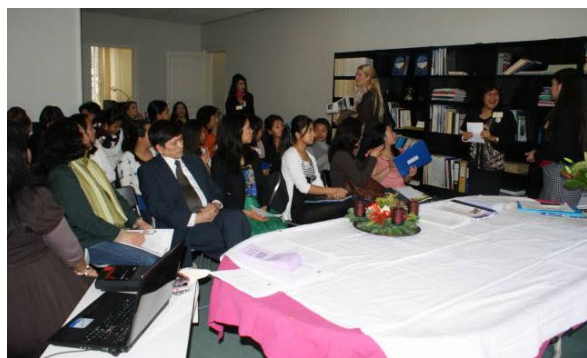
The lively discussion during the course of the afternoon.